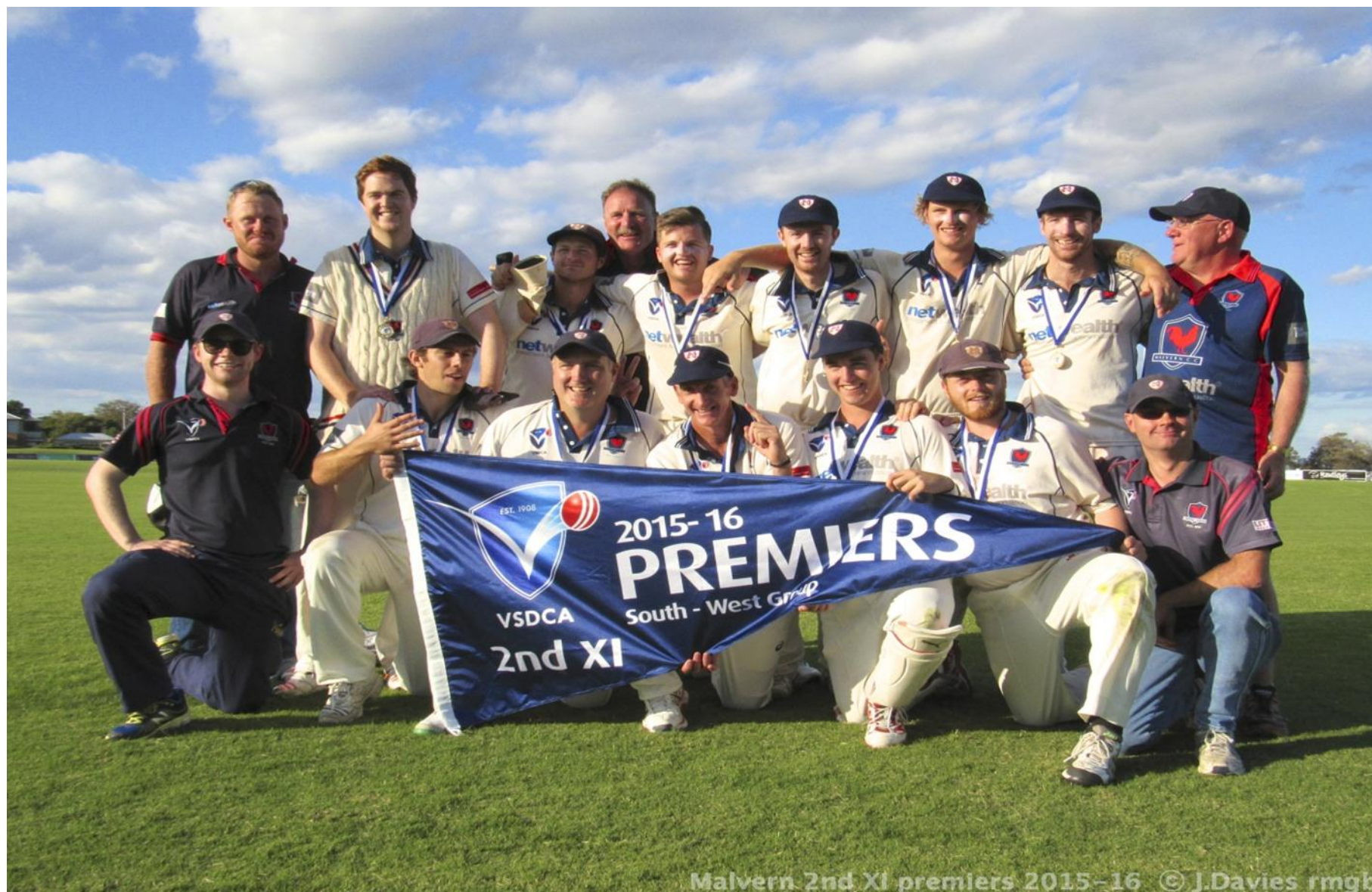
Malvern 2nd XI premiers 2015-16