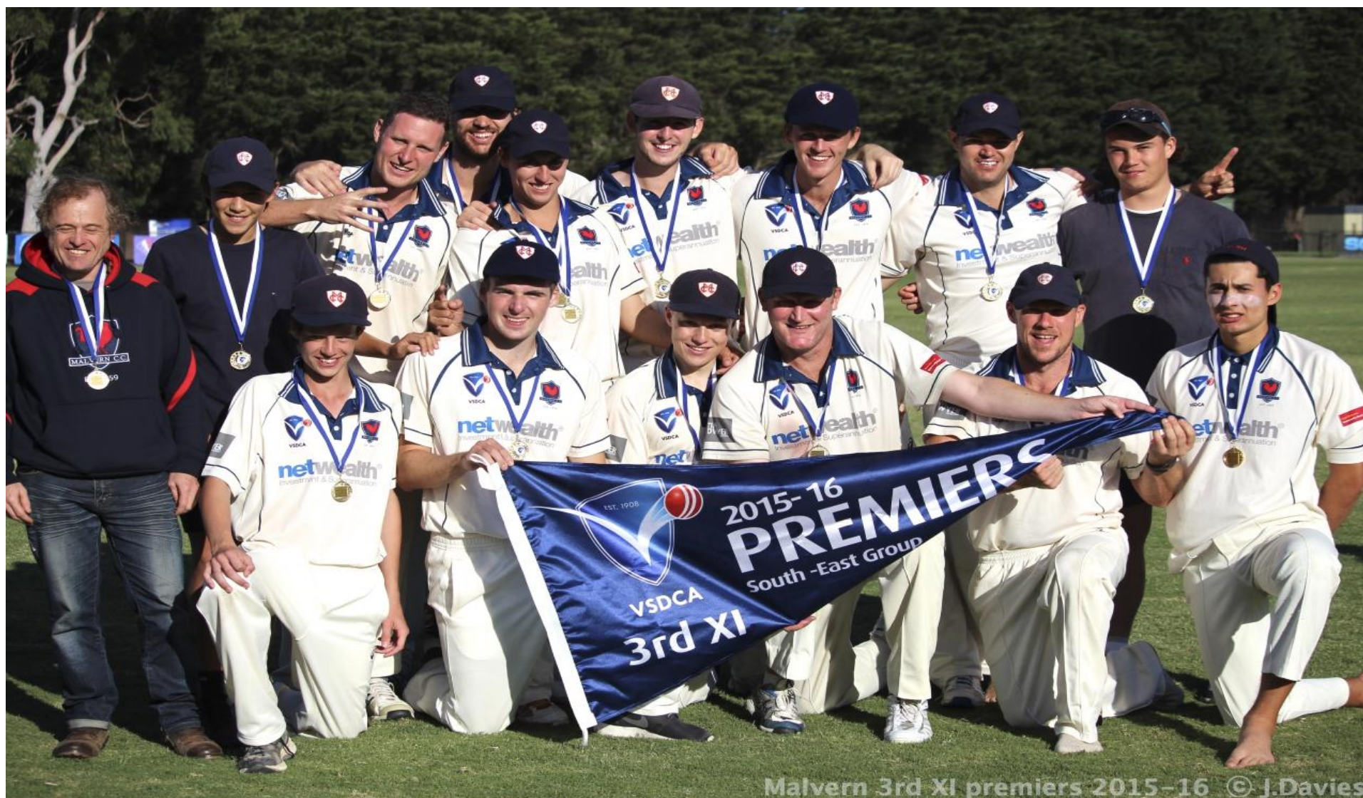
Malvern 3rd XI premiers 2015-16